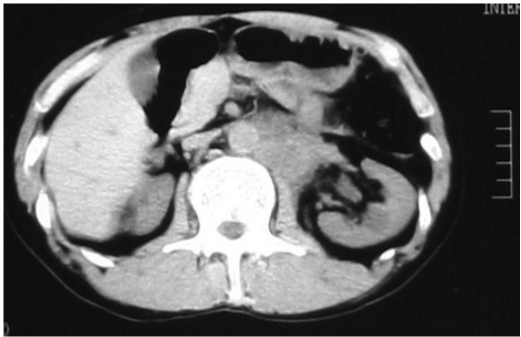
Fig. 1d April 10, 2000