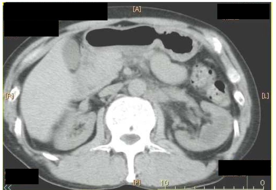
Fig. 1f October 19, 2009