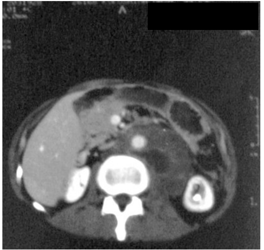
Fig. 1b April 12, 1999